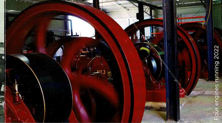
Four engines running 2022

Four Richard Hornsby & Sons engines were sent from England. Two drove ammonia compressors, and the other two drove generators. Two engines came to Murtoa in 1910; the next one in 1911 and the last in 1914.