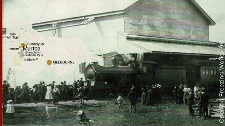
Opening Freezing Works 1911

Proudly part of Annual Event — First Weekend in October